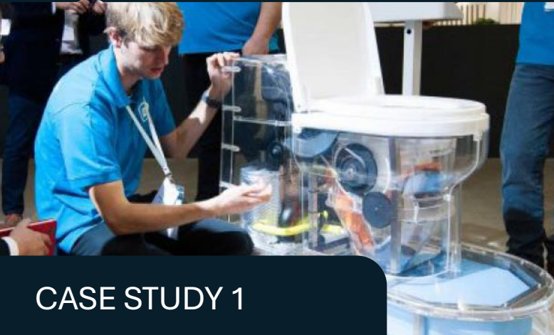
CASE STUDY 1