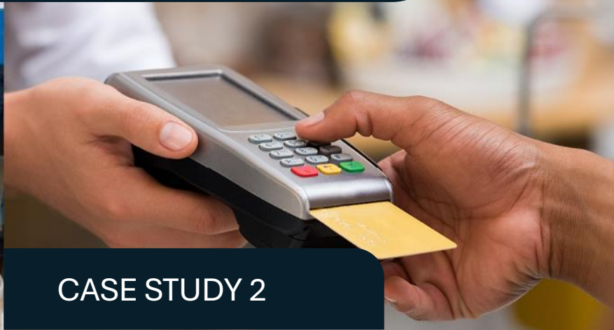
CASE STUDY 2