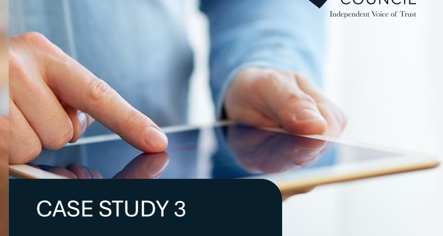
CASE STUDY 3