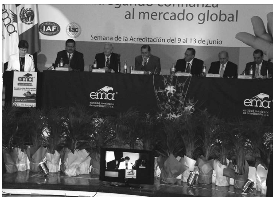
Panel of local and international speakers at the ema conference for accreditation day.

sector of the country. The importance of accreditation to the academic sector was also addressed.