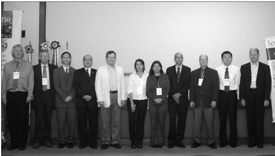
Seminar on Reference Material Producer and Proficiency Testing Provider Accreditation, Rio de Janeiro, Brazil.

The 31st Meeting of the Reference Materials Committee (ISO/REMCO) was held from 10 to 13 June 2008, in Rio de Janeiro, Brazil. The Committee is responsible for the elaboration and revision of ISO Guides related to reference materials, the key elements in assuring reliability and metrological traceability of measurement results made by laboratories in various technological fields.