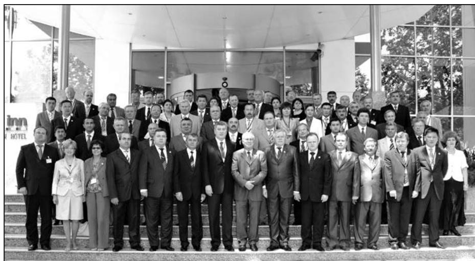
Delegates at the 33rd EASC meeting held in Baku, Azerbaijanian Republic.