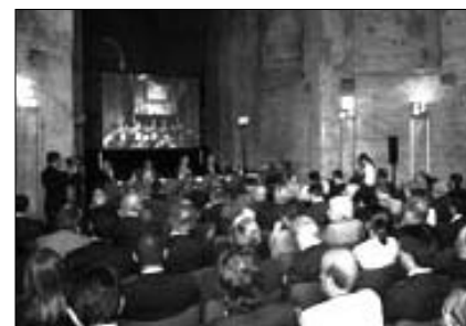
The audience in the picturesque Sala Adrianea, that dates back to ancient Rome.

The main issue of the symposium was the new European Regulation setting out the requirements for accreditation and market surveillance, related to the marketing of products, that was approved by the European Council on 23 June 2008, and to become operational by 1 January 2010. This is part of a broad package of measures adopted with