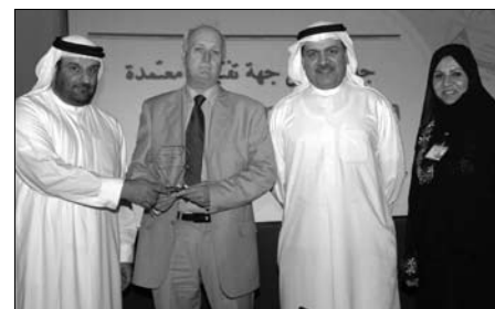
Award presentation to best accredited inspection body.